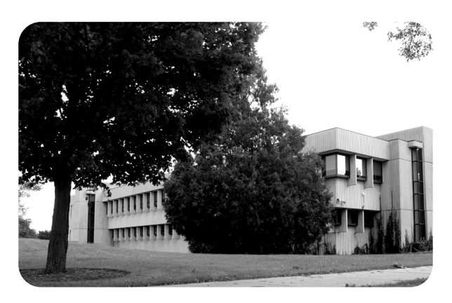
Central Michigan University's Foust Hall houses the Office of Research and Graduate Studies.